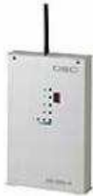
DSC GS3050 - GSM Wireless Alarm Communicator